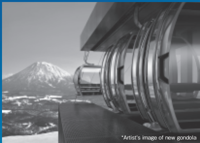
*Artist's image of new gondola