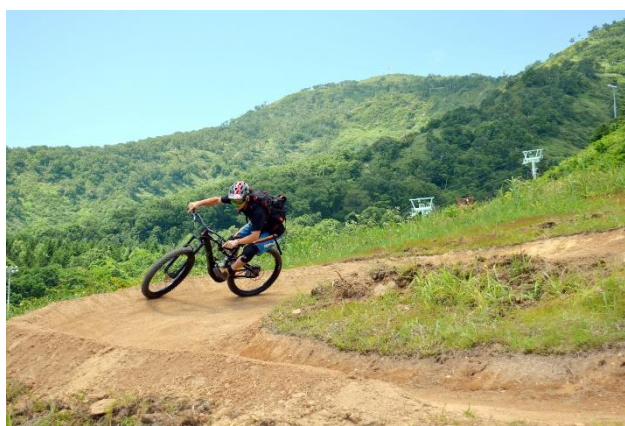
Flow trail course