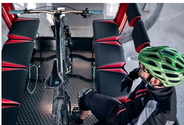
Bike rack (concept image)

The King #3 lift was replaced in 2016, the Ace Family Quad Lift in 2017, and the Mountain Center Annex new ski area facility was added in 2019. A variety of initiatives are being planned for a transition to all-season use with the newly upgraded gondolas, in order to provide a wide range of services not only during the ski season but throughout all the seasons.