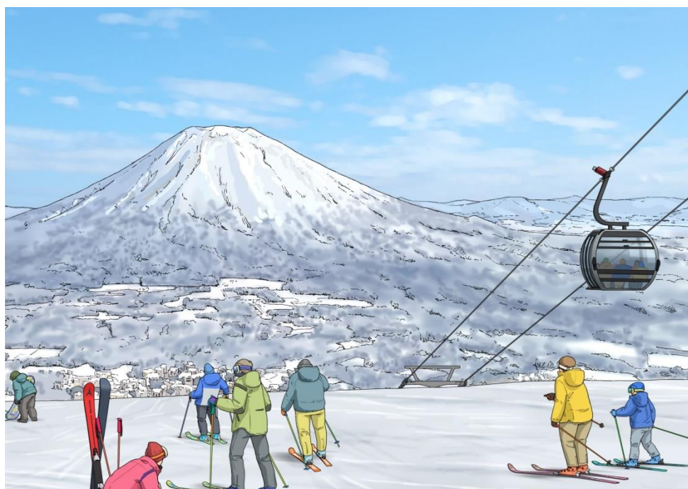
New gondola concept image